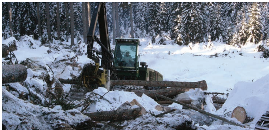
Figure 40: Modern harvesting technologies are used on a daily basis in Slovenia. Without them, we cannot imagine the performance of forest works, especially in forests that have been damaged by natural disasters.

Soil acts as a storage of greenhouse gases and represents important terrestrial pool of carbon. Providing nutrient cycling and filtering services, soil regulates greenhouse gas fluxes. Soil compaction has a negative impact on virtually all physical, chemical and biological soil properties and, consequently, on the provision of soil ecosystem services. Soil compaction is causing modified soil physical properties, poor soil aeration, lower biological activity that can decrease availability of macro and micro nutrients, nitrogen fixation and carbon cycles in favour of more emissions of greenhouse gases under wet conditions (Nawaz et al. 2013) to preserve forest soil quality and retain forest productivity. Therefore, the use of FHO in forests should be carefully planned. The FHO suitability map helps in regulating the use of FHO and is a fundamental step in sustainable management of forest soil.