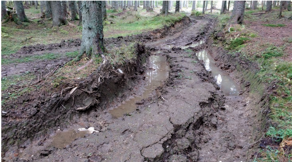
Figure 41: Heavy machinery used in inappropriate conditions may damage soils; consequently, the provision of ecosystem services is reduced.